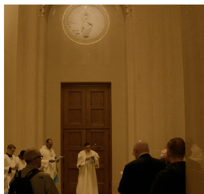
Prayers at the Rondel of Our Lady Star of the Sea

At the end of the Mass, those present participated in a procession inside the Basilica of the National Shrine of the Immaculate Conception and prayed in front of the chapel erected in honor of Stella Maris.